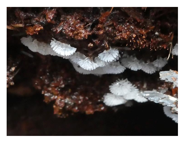
Ceratiomyxa fruticulosa - ice crystals (KM)

Other slime moulds seen today were: Comatricha sp., Trichia (mouldy) and Cribraria (mouldy/old)